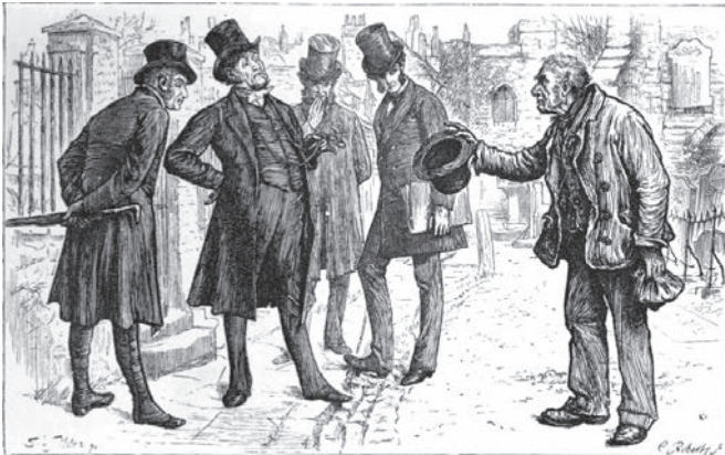
Fig. 4. The finished drawing, 'Durdles cautions Mr Sapsea against boasting', published in June 1870.

appeared and still appears in reality, is a wooden structure, with weather-boarded sides and a steeply gabled roof. But Fildes has now replaced it with the upper storey of a different gate, which anyone who knew their way around Rochester would again be quick to recognise.