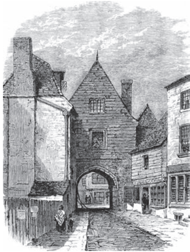
Fig. 1. College Yard in Rochester as it used to be: a drawing by Alfred Rimmer, published in 1877.

E ARLY IN 1870, A PROMISING YOUNG ARTIST, Luke Fildes, was hired to provide the illustrations for Charles Dickens's new novel, The Mystery of Edwin Drood . The plan was for the book to be issued in twelve monthly 'numbers' (a number comprised thirty-two pages), with two illustrations in each number; Fildes was being commissioned to produce twenty-four drawings. The first number published was dated April 1870. Before his death, Dickens had seen the final proof for Number 4; he had seen a rough proof for Number 5; he had already written two chapters for Number 6. Those three numbers were published in due course, under the supervision of John Forster (Number 5 in a very different shape from that intended by Dickens), and Fildes supplied the drawings for them. In the end, therefore, he produced just twelve illustrations.