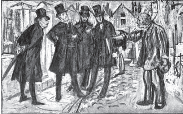
Fig. 3. A rough sketch of College Yard, with the figures put into position, reproduced by Thomson (1895). Again, the original drawing is in the Beinecke Library

Sure enough, among Fildes's drawings there is a sketch – a rapid but accurate sketch – which can instantly be identified as a view of College Yard (Fig. 2). Evidently Dickens had taken or sent Fildes down to Rochester, in spring 1870, to make a sketch of the scene that he wanted for a background here (and possibly some other scenes too). Fildes was standing further back than Rimmer, and further to the right, but those features which are represented in both drawings will be seen to match up exactly. The railings on the right enclose the burial ground north of the cathedral; the railings on the left enclose the burial ground of St Nicholas's parish; the parish church itself is just visible on the right. College Gate stands at the bottom of College Yard, at the entrance into the precinct from the High Street. Through the archway can be seen the jettied building on the far side of the street, at the corner of Pump Lane, which was, for as long as it lasted, an admired feature of the townscape.