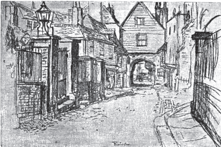
Fig. 2. Fildes's sketch of College Yard, reproduced by Meynell (1884: 528). The original is in the Beinecke Library.

That scene was picturesque enough to catch the eye of an artist from time to time. The drawing reproduced here (Fig. 1) is by Alfred Rimmer (1877: 126). (Other drawings exist of about the same date; there are some photographs too. The row of buildings on the left was demolished c. 1888; the house on the far side of the High Street, visible through the arch, was razed and rebuilt c. 1903. The gate and the buildings on the right are still there, looking much the same.)